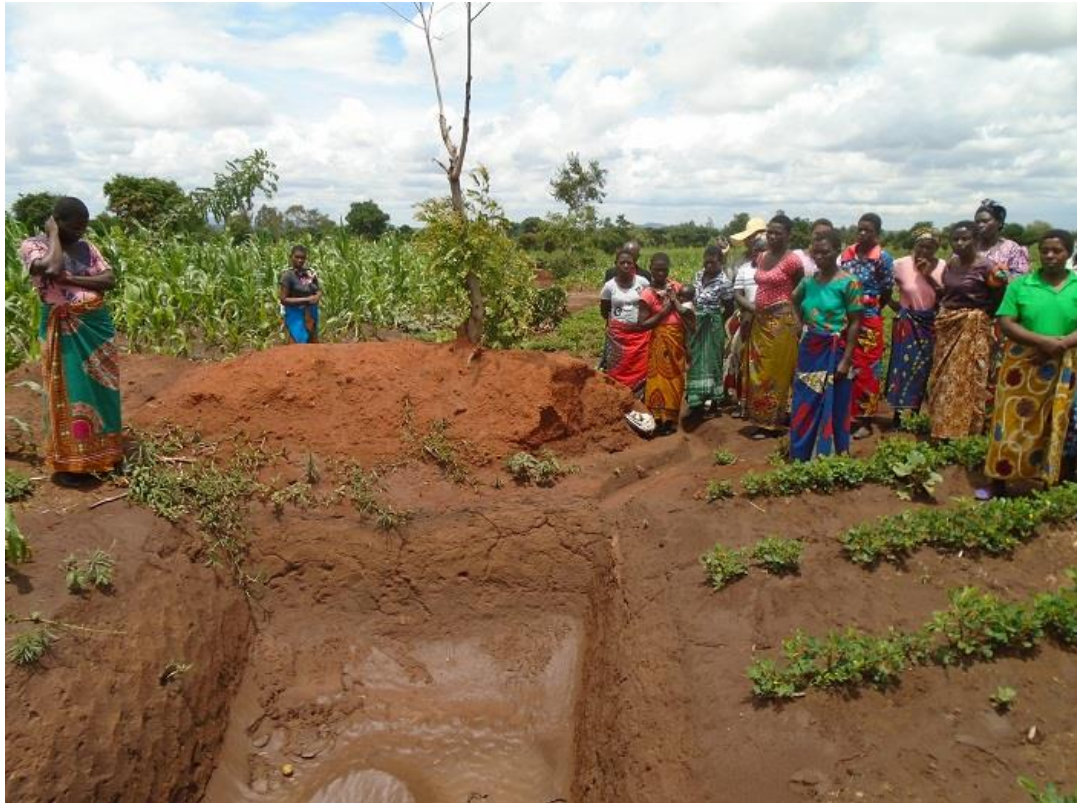
Farmers listening attentively