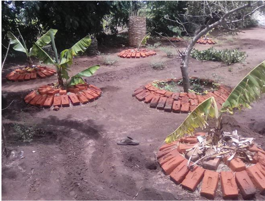
Banana grown using road run-off

Some of the benefits that farmers have noticed include improved ground water recharge evidenced by the revival of some boreholes which had dried up. The tree planting exercise which the association is promoting under this project has also contributed to groundwater recharge, nutrient availability to our fields, economic development and nutrition status of their families. Farmer's fields which were previously abandoned due to land degradation have been reclaimed and they able to cultivate in them again. Up-stream water harvesting has increased water availability downstream in wet lands also referred to as Dambos which are mostly used for vegetable production and grazing of livestock. The GVH indicated that they not just planting any type of tree, but only beneficial trees, these include fruit trees and nitrogen fixing trees.