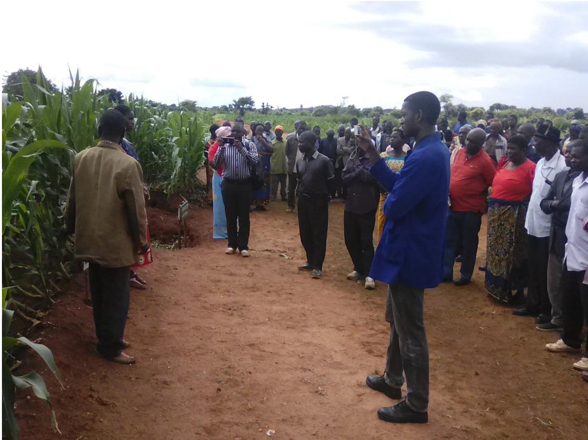
Cross of farmers and Extension on a field showcasing conservation agriculture and Organic manure application